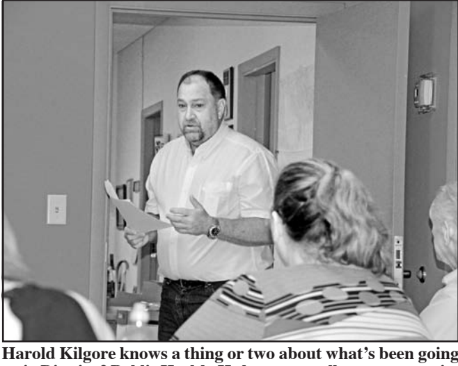
on in District 2 Public Health. He has personally seen properties diminish in other counties in light of new rules enforcement favored over 30-year precedent

County has operated since 1986 under the requirements as interpreted. We have many lots platted prior to 1984 and intend to continue to treat those lots as grandfathered."